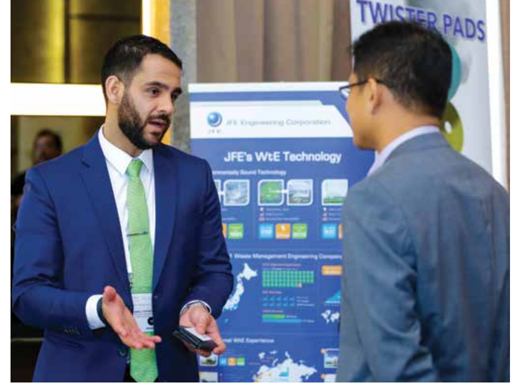
JFE Engineering was one of many technology and service providers from the environmental services industry that participated in the inaugural CleanEnviro Summit Singapore Catalyst in 2017

In the field of vector control, the National Environmental Agency worked