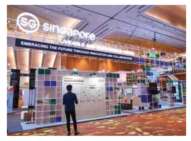
Above: The Singapore government's impressive pavilion, which showcases smart city solutions from the likes of the Housing Development Board and the Urban Redevelopment Authority of Singapore

Hong Kong 25<sup>th</sup> floor, 625 King's Road, North Point Hong Kong Switchboard: +852 3962 4500 Direct: +852 3962 4503